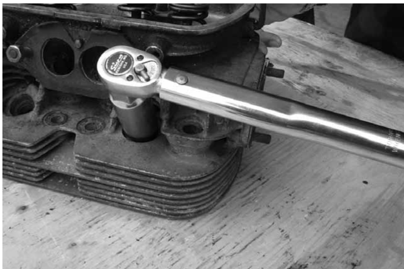
Top: lubricate the threads of the spark plug and wind it in by hand; Above, get the torque spec for your engine and use a torque wrench to tighten. All done.

An insert that is too long for the hole will result in some of the Helicoil protruding into the combustion chamber. This must be avoided, and there are two ways to correct this. First is to cut it to length beforehand by pulling the spring open and notching the upper end with a triangular needle file, then breaking off the excess. This is the only way it can be done with the head still installed on the engine. If the head is on the bench it is also possible to install the too-long Helicoil, and then notch and remove the excess that protrudes into the combustion chamber. Either way there must be nothing hanging into the chamber or it can cause a hot spot that will glow and cause preignition.