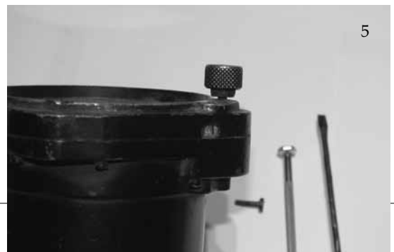
Above: Begin by setting the field elevation, then removing the brass screw that holds the lockpin.